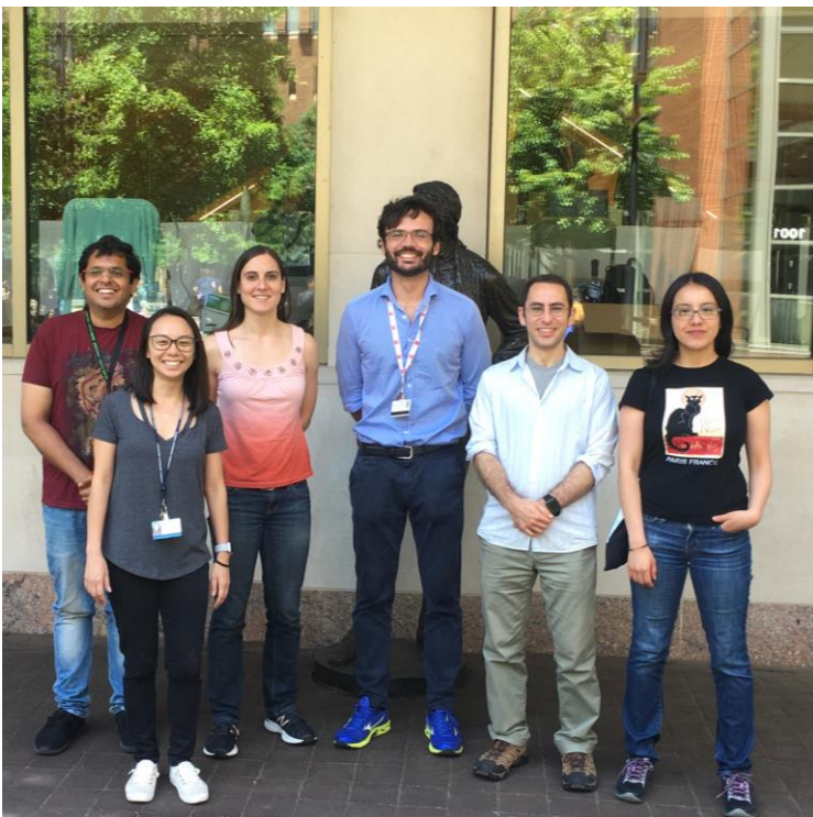
JPA Executive Board (2019-2020)