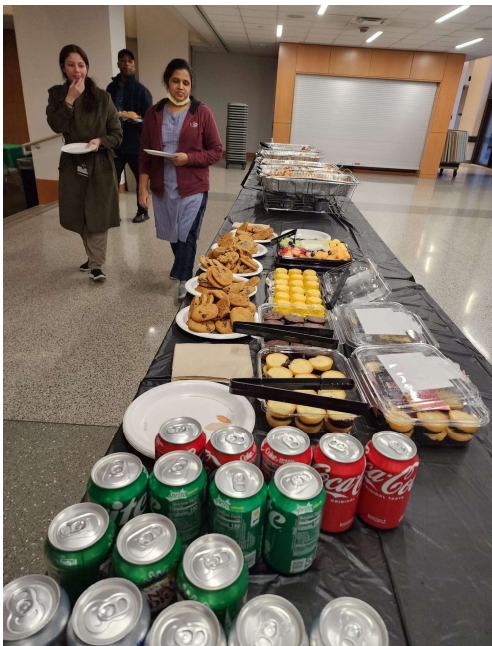
Postdocs enjoying the spread!