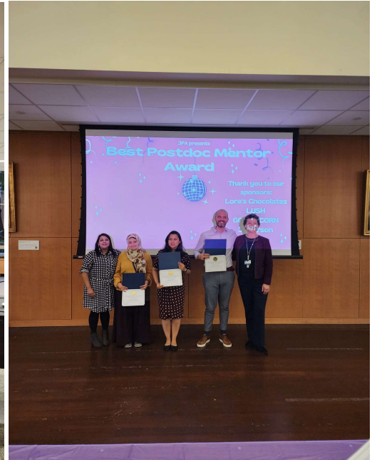
Congratulations to the winners and nominees!