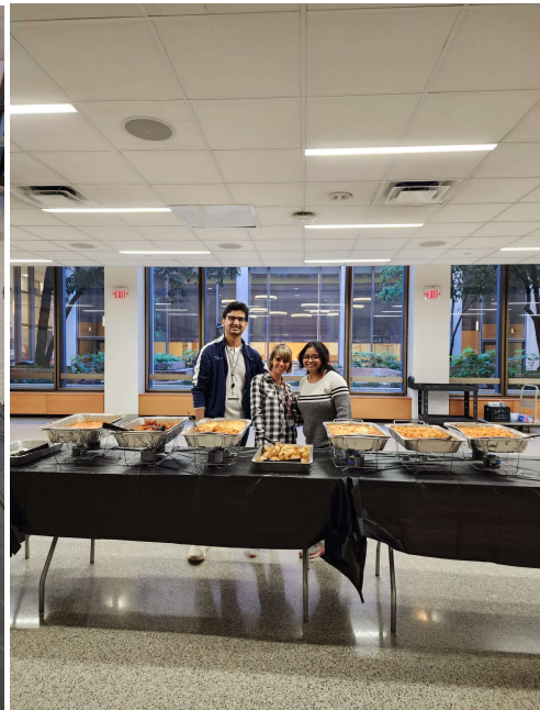
JPA members on food duty!