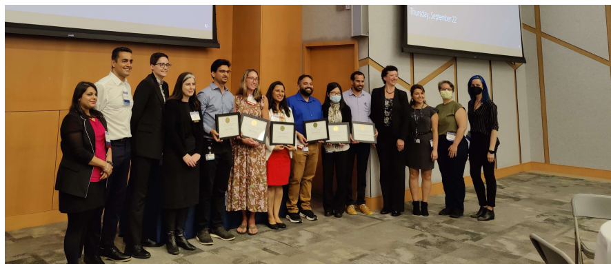
Winners of best poster/research talks along with the PRS organizing committee members!