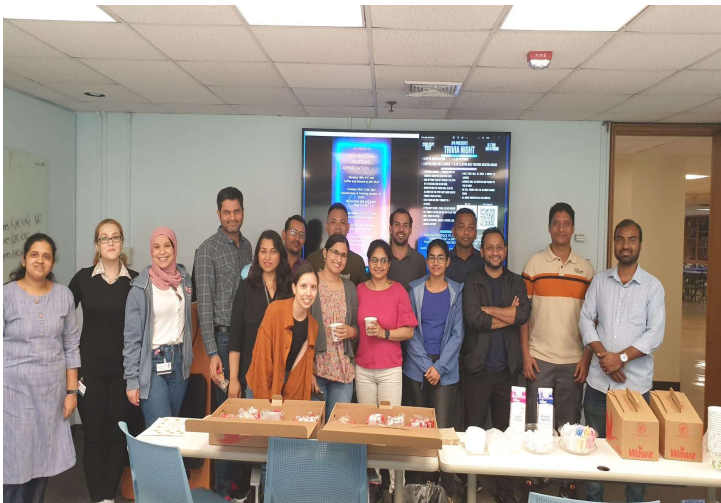
A significant turn-out for coffee and donuts on day 1 made the JPA executive board members happy to pose for a photo!