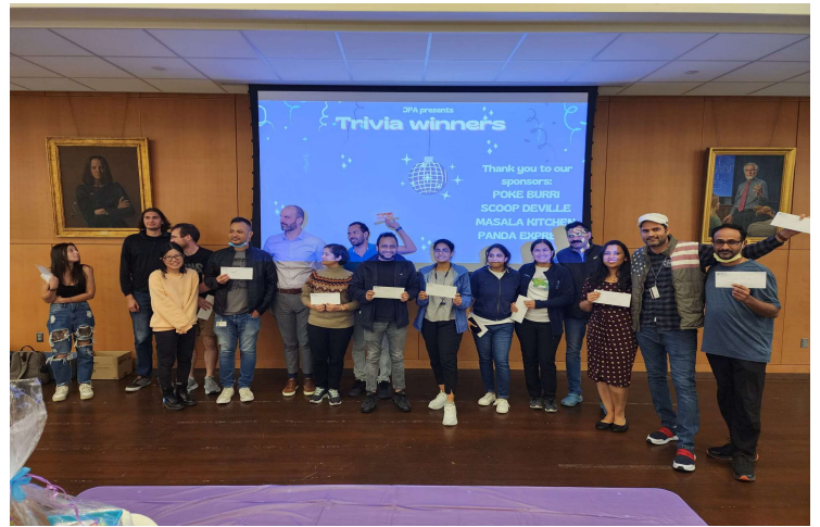
The TRIVIA Winners!