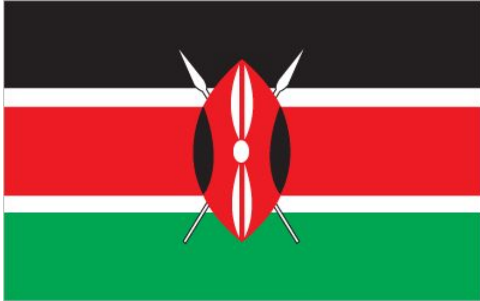
Fig 1: Flag of Kenya