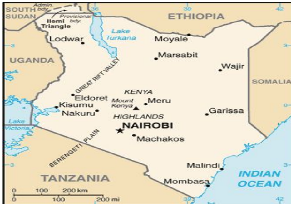
Fig 2: Map of Kenya